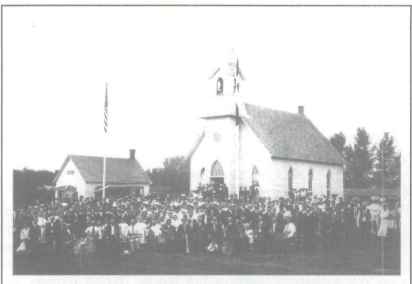
St. John's Evangelical Lutheran Church in Denmark Township, Iowa. To the left is the Danish primary school, also used as the Sunday School. The church, founded as St. Ansgar's Danish Evangelical Church, was the first church in Denmark Township.