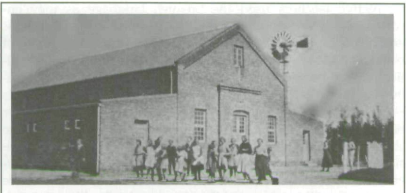
The Danish school in Lumb (ca. 1920).

Educating children whose parents were both Lutheran and Danish in a Catholic and Spanish-speaking country required a curriculum that would include Argentine subjects. To fulfill the state requirements for ethnic schools, Argentine teachers were also needed.<sup>53</sup> Because one of the purposes of the church was to preserve the Danish language, the school's curriculum followed the one used by most elementary schools in Denmark, and teachers were hired mostly from the old country. During the school day, the children spent many hours improving their skills in the language they spoke to their parents daily. From Monday through Friday, the children spent 70 percent of their time at school studying the history, geography, religion, and language of Denmark. In the afternoon those same students heard another language, became acquainted with another geography, familiarized themselves with a new culture, and learned to respect the great men who had ruled their new homeland many years after the reigns of the Danish kings Valdemar Sejr or Christian IV.54