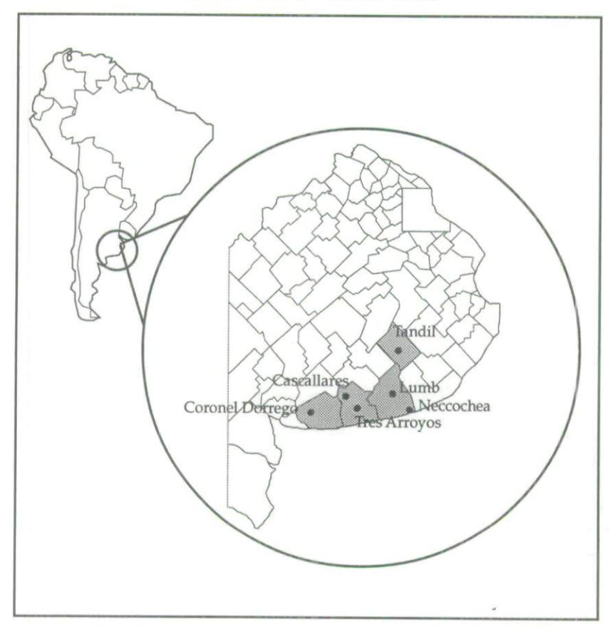
MAP 2 DANISH SETTLEMENTS IN THE PROVINCE OF BUENOS AIRES

Argentina's first group of Danish immigrants arrived in Tandil in the summer of 1860 from the parish of Magleby on the island of Mön in eastern Denmark. Until the late 1880s, Tandil was the sole Danish settlement in the province of Buenos Aires, but after the southern partidos of Tres Arroyos, Necochea, and Coronel Dorrego were incorporated,<sup>3</sup> Danish immigrants began a slow but steady march into that area. Most of them came from the Limfjord parishes in the north of Jutland or the districts of