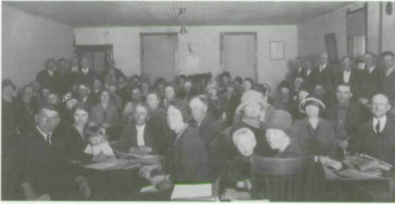
At least two children attended the Plymouth County Rural Leadership Training School sponsored by the IFBF in 1925.