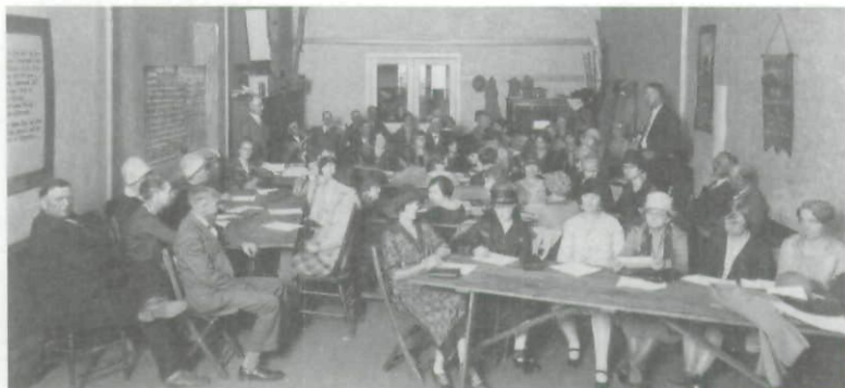
Women predominated at the Mahaska County Rural Leadership Training School sponsored by the IFBF in October 1928.

women still participated in home demonstration programs sponsored in conjunction with the Extension Service. They also carried on with organization work for the Farm Bureau. In 1929, for example, Cherokee County Extension Agent Clarence Turner proposed that the Farm Bureau try to develop more female leaders, since the women's programs "no doubt played an important part in keeping the membership at its present figure." Even in 1935, when the Cherokee County Farm Bureau had a membership of only 506 families, less than half of the average between 1921 and 1929, there were 116 female school district cooperators in 15 townships, 147 local leaders, and 1,286 women who attended demonstration meetings. Across the state in 1930, 187,737 people attended home economics demonstration meetings, and in 1931, 10,169 women still served as local leaders to help filter the lessons to the local levels. 21