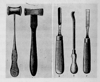
Hammers and Chisels