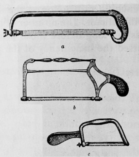
a, Bow saw; b, Butcher's saw; c, Metacarpal saw

Again and again, he voiced his discontent and wrote sharp criticisms of field hospitals. One example is sufficient. On April 21, he wrote that "There are no buildings here that can be used for Hospitals. Tents with wet ground for floors are no place for Patients." He added that serious cases should be sent to Huntsville where there are better accommodations, but it is not so ordered by those in