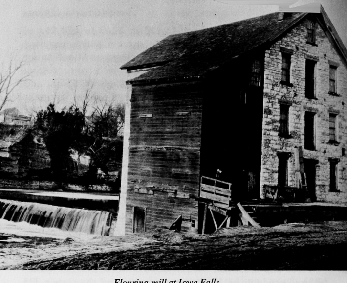
Flouring mill at Iowa Falls.

milling industry grew apace, consolidating its position as Iowa's ranking manufacture by raising the value of its production to $15.635,000 in 1869 and $19.089,000 in 1879. However, the 1870s were the peak years for flour and wheat in Iowa; the production of both declined thereafter. 28