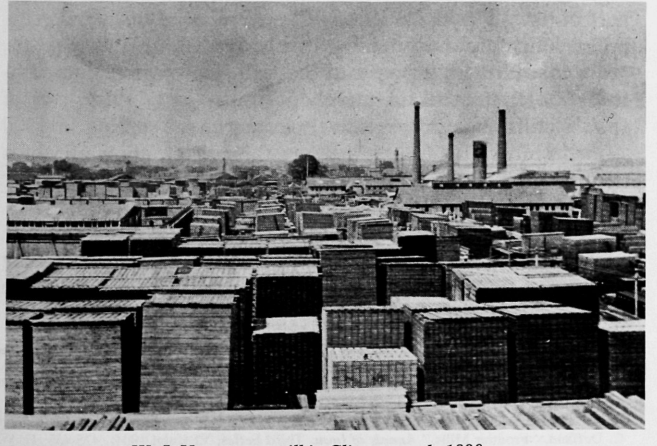
W. J. Young sawmill in Clinton, early 1890s.

The output of the state's planing mills rose in value from $3,588,000 in 1889 to $5,295,000 in 1899 when Iowa ranked eighth nationally in planing-mill production. The production of the state's sawmills, as mentioned above, was valued at $8,677,000 in 1899, but forty percent of this amount