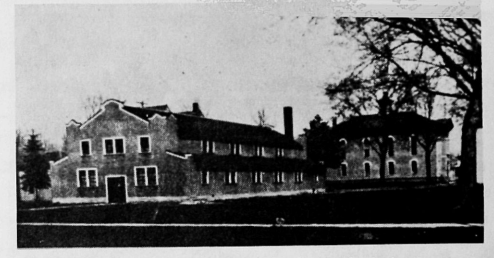
Cedar Vally Seminary Gymnasium, built in 1915, had an athletic room 70 x 32 feet, studios for the Music Department, and a stage for Glee Club concerts, oratorical concerts, etc.

prominent civil engineer who ultimately was invited to work in Washington.