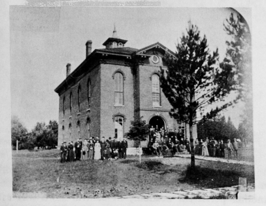
"Old Central"—the main building of Cedar Valley Seminary in Osage. Photo taken in 1881, showing faculty and graduates. Hamlin Garland is one of the graduates in this picture.

advertised lure for students. There is no clear evidence that the bait worked, yet all students participated, and in line with the prescientific psychology of the day, all students developed their "character" through participation. Such socializing qualities of character as cooperation, competition and fair play were said to be "disciplines" developed through sports.