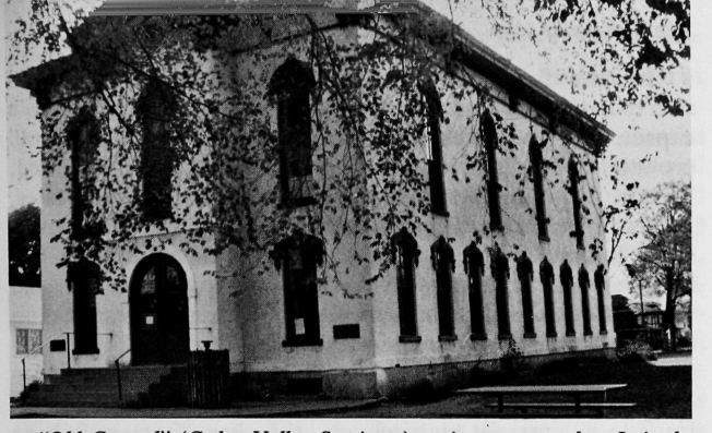
"Old Central" (Cedar Valley Seminary) as it appears today. It is the home of the Mitchell County Historical Museum.

like this, education is the most potent factor in dignifying its homes and elevating its citizens." 32