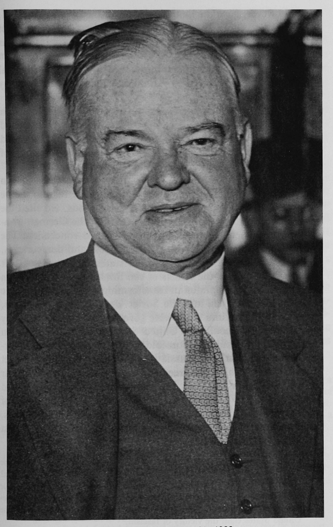
Hoover as he appeared in 1933