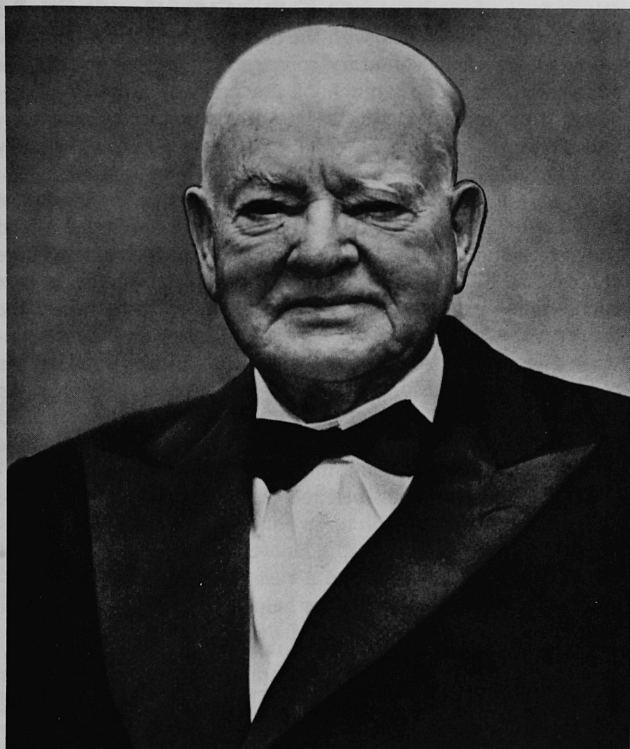
Herbert Hoover at age eighty-three.

gested that five or ten million dollars donated "by substantial men" would see the country through the relief needs of the year "without a breakdown in our fundamental ideas of government." 25 While Hoover forced the Red Cross into relief and a broadened concept of its responsibilities, he continued to place his faith in an elitist concept of charity. Had the president in the fall of 1930 used the leadership abilities he demonstrated in the