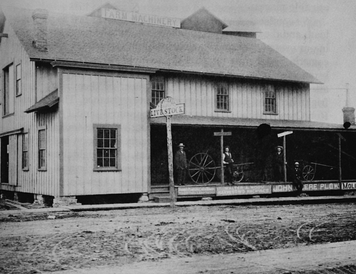
Foster and Bailey Implement Store in Grinnell, circa 1907