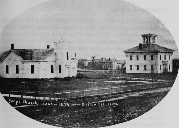
Congregational Church, Grinnell, 1860-1879