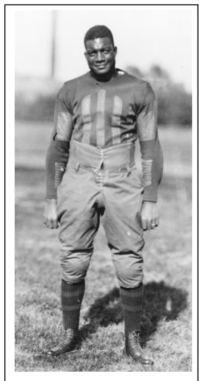
Jack Trice in his ISC football uniform, 1923.

During the hard-fought game, Jack suffered a shoulder injury in the first half but continued to play; it was later discovered that he had broken his collarbone. At half-time, the score was tied. 7–7. Teammates later indicated that midway through the third quarter, Jack implemented what was described as "a rolling block," throwing himself in front of an oncoming rush of Minnesota players running "a crossbuck with heavy interference." Jack ended up on his back. rather than on his stomach, which was the intended position. Apparently, the coach had discouraged this play because it was too dangerous, and in later years the play was outlawed. During the play, Jack was trampled by Minnesota players. He was helped