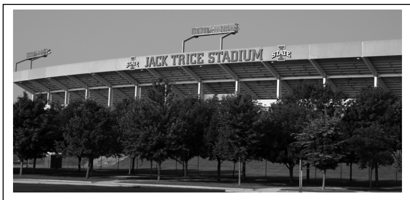
Jack Trice Stadium, photographed in 2008.

as well as 85 percent support from student athletes. The regents approved the change by a vote of seven to two. <sup>78</sup> At the same time, the GSB voted to move the Trice sculpture from campus to a location near the football stadium. <sup>79</sup>