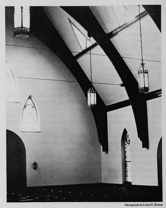
Interior view of Trinity Church, 1974