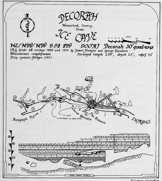
Figure 1. Map of the Decorah Ice Cave.

known glacière in all of North America and was the most famous cavern (of any kind) in the entire Midwest.