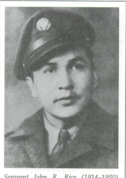
Sergeant John R. Rice (1914–1950).

September 6, as the First Cavalry fought to slow the North Korean advance, 37-year-old John Rice was killed in action while leading a squad of riflemen in a desperate effort to hold the Naktong River bridgehead a few miles north of the village of Taegu (Tabu-Dong). He was one of 307 Nebraska servicemen killed during the conflict.<sup>3</sup>