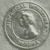
Typical Tablet Affixed to a Glacial Granite Fragment Erected in Van Buren County, Iowa (See article beginning on page 32)