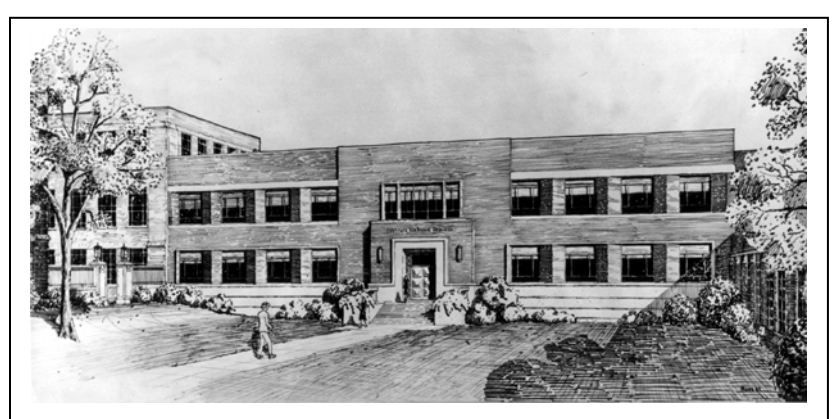
The Institute for Atomic Research, also known as The Link, was built to house the IAR's administrative offices, which physically connected the chemistry and physics departments.

That may account for the relative calm in light of newly defined lines of authority.