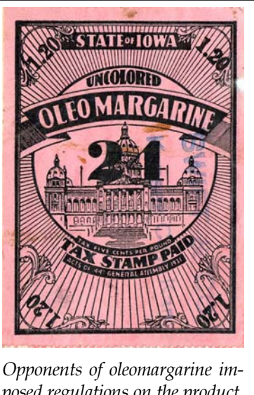
opponents of oteomargurine imposed regulations on the product, including requiring that it remain uncolored and that it be taxed. The tax stamp itself is colored pink.