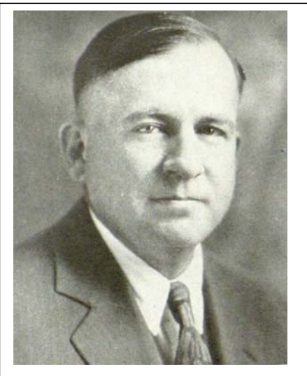
Iowa Agricultural Station Director Robert E. Buchanan.

serving "as a benefit to agriculture." Furthermore, any social science to be done through the Agricultural Experiment Station must be as much like physical science as possible, in that it is "to be as objective as is possible and above all to avoid language which would indicate advocacy rather than objective analysis."<sup>37</sup>