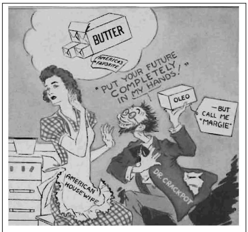
The dairy industry depicted the American housewife as doing all she could to resist the mad science that must be behind the duping of as many margarine users as there already were. From Creamery Journal, July 1943.

ad accused ISC economists of proposing "that the housewives of America be denied butter and be forced to accept a product they have refused on its own merits." The ADA even depicted ISC as subverting the war effort by "taking a stand against the Government's Wartime Food Production Program." The ADA claimed that no fewer than "five million dairy farmers are shocked at the rumpus created by the much-discussed Pamphlet No. 5," which "rocks the very foundation of diversified farming" and "challenges the dairy farmer's way of life." Iowa dairy representatives, following immediately in the slipstream of the ADA's advertisement, passed a formal resolution declaring that the pamphlet "jeopardizes the national war food program" and "has done untold injury to a basic industry which