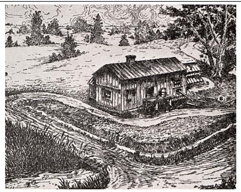
Iowa's first creamery was built at Spring Branch, near Manchester, in 1872. Spring Branch butter took first place at the Philadelphia Centennial Exposition in 1876. From Iowa Farm Economist, June 1940.

and Sociology eventually resigned in protest, interpreting the retraction as a violation of academic freedom and a development that endangered the social sciences at ISC. National observers wondered whether events in Iowa had implications for social science in general.<sup>4</sup>