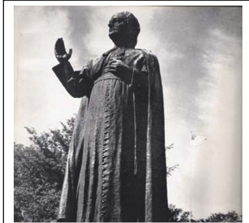
This statue of Archbishop Mathias Loras, the first Catholic archbishop west of the Mississippi River, blesses Dubuque from the apex of the boulevard that bears his name.

also due to the widespread conviction that Franklin Roosevelt and the New Deal had ameliorated the harsher aspects of the Great Depression. Part of it, too, was attributable to the fact that Dubuque's workforce in the 1930s, '40s, and '50s was heavily unionized, also a legacy of the National Labor Relations (Wagner) Act and other pro-labor New Deal policies. My father was a shop steward for the Teamsters Union local at the Dubuque Star Brewing Company, and my mother was fired from her job for supporting a unionization drive at Woolworth's five-and-dime store.