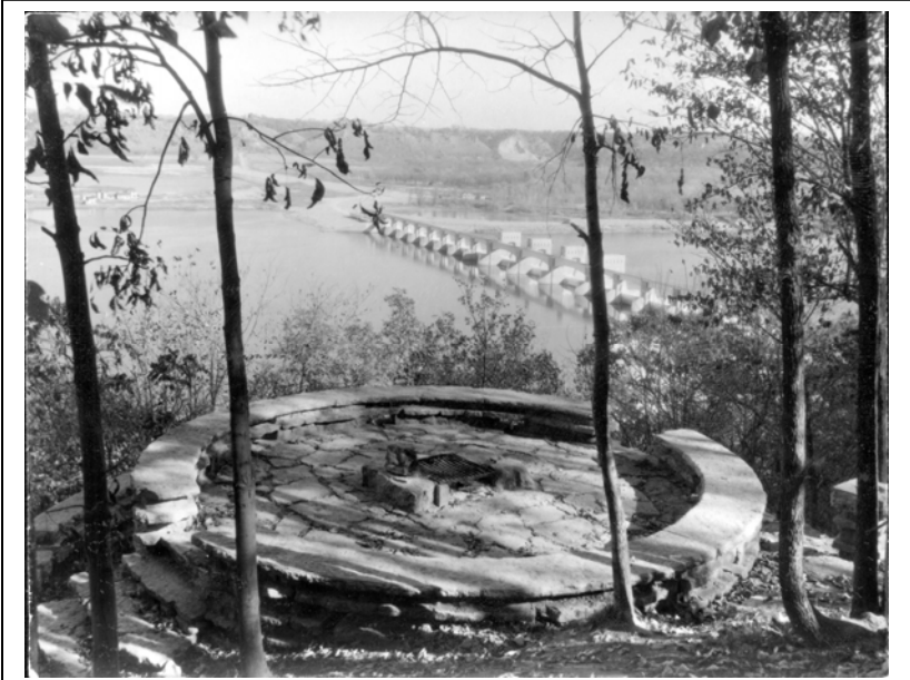
Eagle Point Park offers panoramic views of the Mississippi River and the tri-state area.

higher learning, including Loras and Clarke colleges, the University of Dubuque, and Wartburg and St. Bernard seminaries. For the majority who did not pursue higher education, working at “the Pack,” “Deere’s,” or other unionized shops was the zenith of blue-collar employment, providing wages that lifted thousands into a middle-class standard of living.