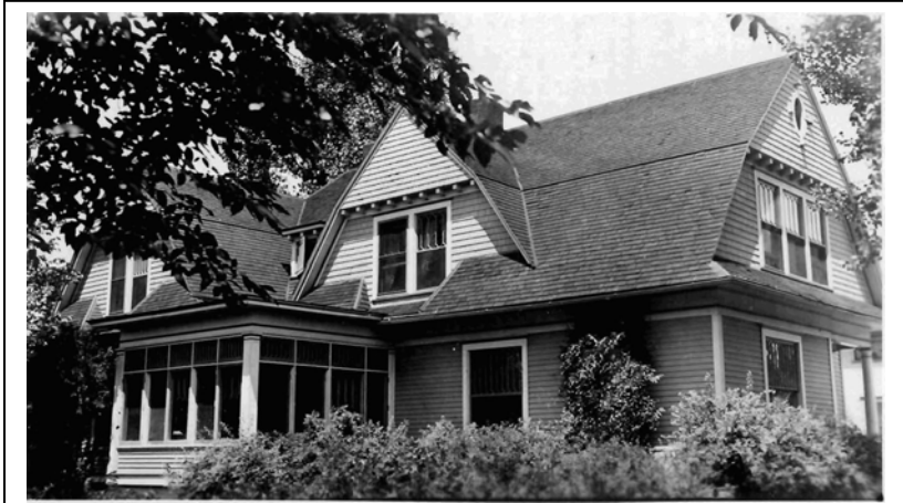
The author's family home at 605 Kellogg Avenue in Ames. In 1961 it was demolished to make way for an automobile repair shop.

spite almost heroic efforts by my Texas relatives to keep me in the fold. My bookshelves contain some of their efforts— Roadside Flowers of Texas , Great Rivers of Texas , The Raven , A Life of Sam Houston , Great Cities of Texas —all Christmas or birthday gifts. I think I once received a gift subscription—some of my relatives being tenacious Texas liberals—to The Texas Observer .