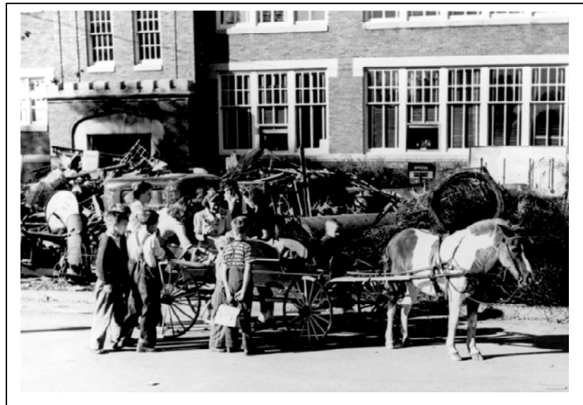
Youngsters participate in a scrap metal drive in Hampton during World War II.