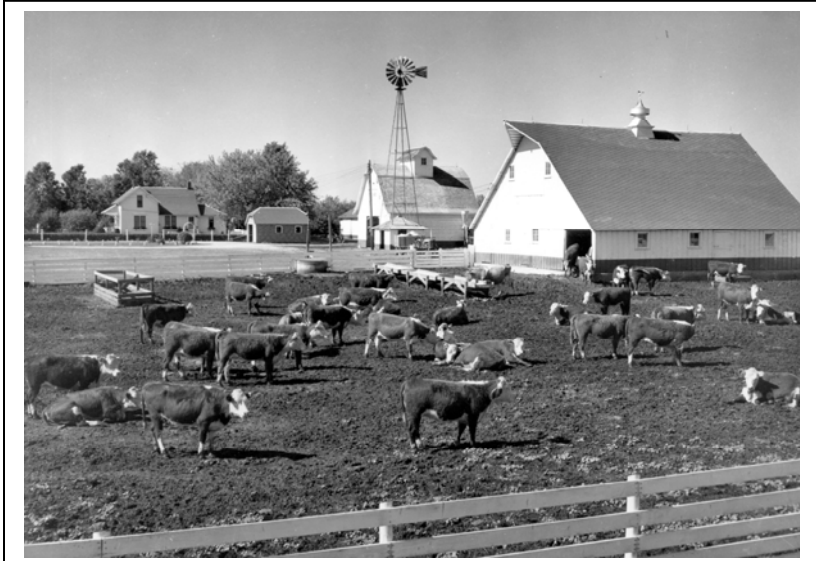
Windmills were once a prominent feature on most Iowa farms.

dries in the sun to make a chip of organic material that burns readily as wood for cooking and heating. There is no great intellectual payoff to this example, of course, but pull together the natural history of the plains and the lessons of how the environment and the human responses to it determined culture, as Webb did in The Great Plains , and one has a methodology that is applicable to Iowa and every other place on earth. Webb's genius, as that word was once defined, was in "seeing what everyone else has seen but thinking what no one else has thought."