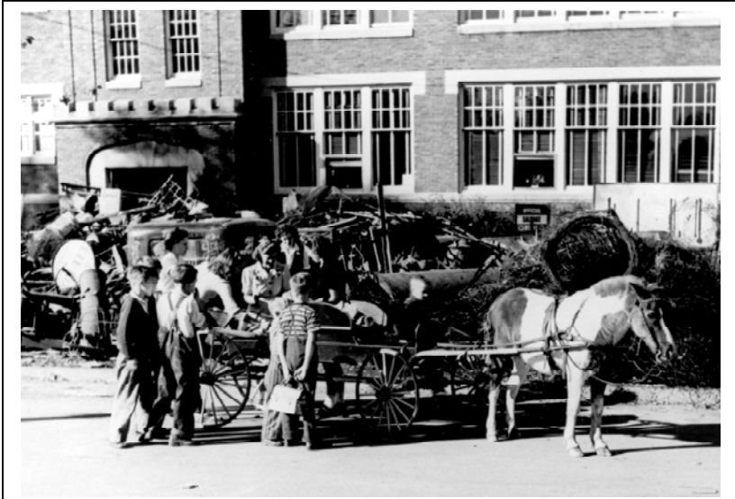
Youngsters participate in a scrap metal drive in Hampton during World War II.