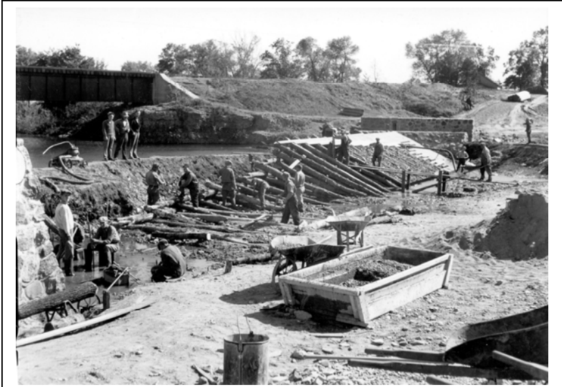
WPA workers construct a dam on the Shell Rock River near Plymouth in Cerro Gordo County during the Great Depression.