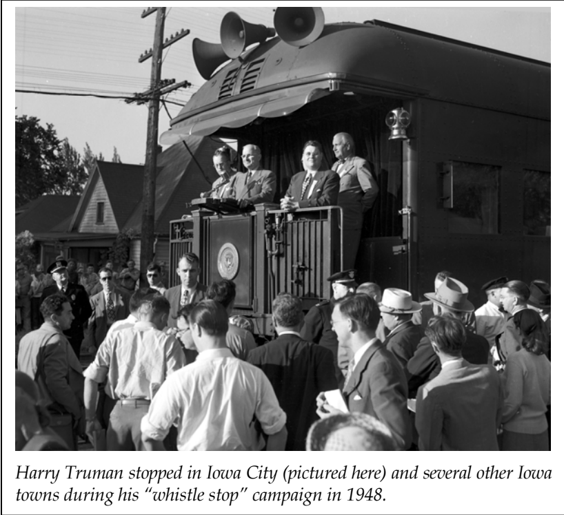
Harry Truman stopped in Iowa City (pictured here) and several other Iowa towns during his "whistle stop" campaign in 1948.

Media: Contentious Relations, Belated Respect (1997). A referee for the publisher advised me to omit a story attributed to Truman by an anonymous news reporter that brought back into circulation the Missourian's occasional mild use of profanity. According to the story, reporters who accompanied Truman on one of his early morning walks asked the former president if he thought it would rain. "Boys," Truman replied, in words that could have come from Alf Landon, "I think it is going to rain like hell." The embellishment of this story, midwestern niceties aside and with the storyteller's exaggerated humor, stated that 14 inches of rain had fallen that day. I published that account in my history.