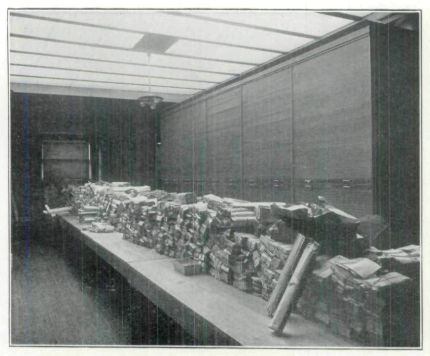
Documents ready to be classified. From the department of Banks and Insurance, office of Auditor of State.