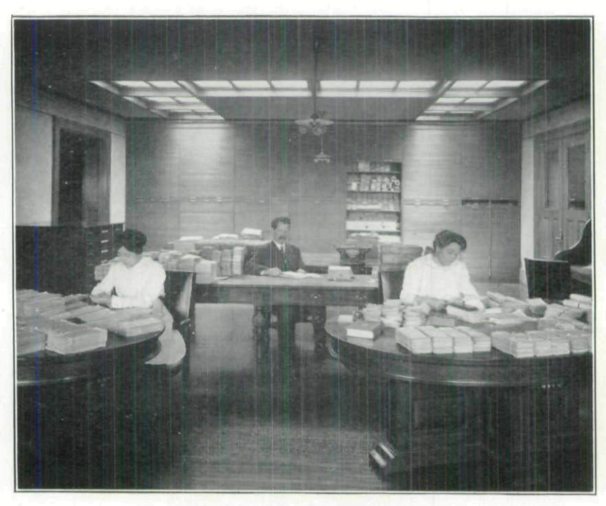
Reading and classifying documents.