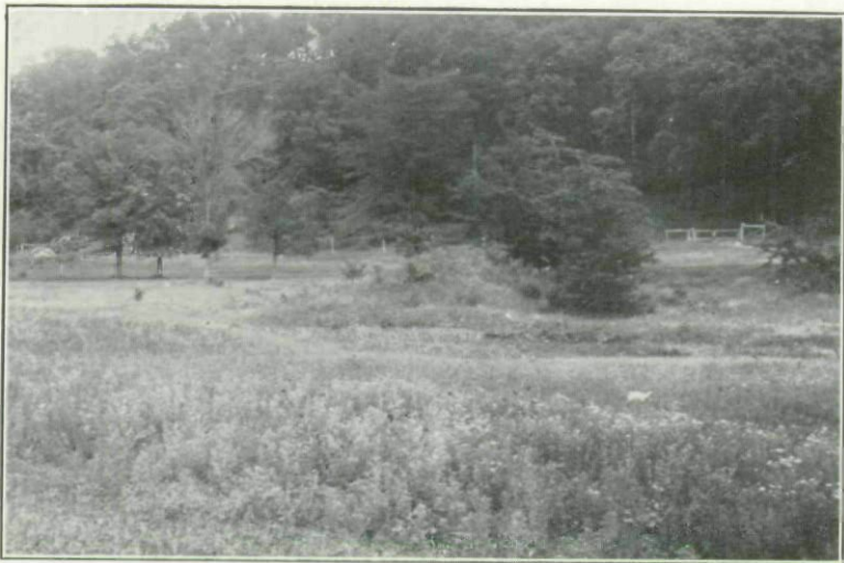
Site of Tesson improvement 1796; building remains are to the left center foreground.