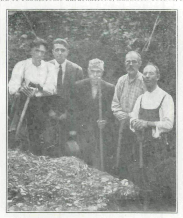
Excavators, Harrison County, Iowa, prehistoric works.