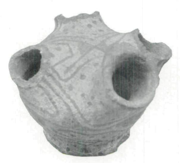
Orange colored pot with four necks (actual size), collection of C. W. Lamb, Magnolia, Iowa.