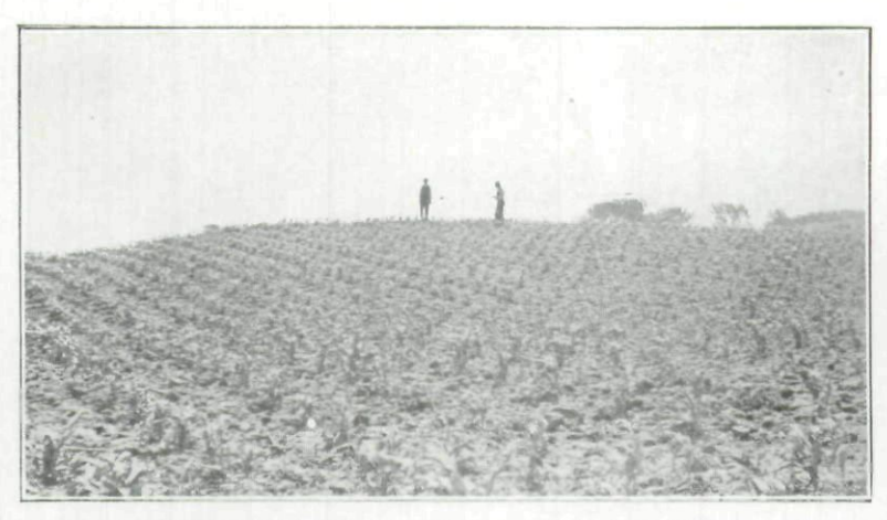
SCENE OF PREHISTORIC EXPLORATIONS, HARRISON COUNTY, IOWA.