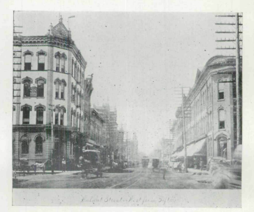
HIGH TELEPHONE POLES, 1880'S Walnut Street, Des Moines, looking West from Fifth Street.