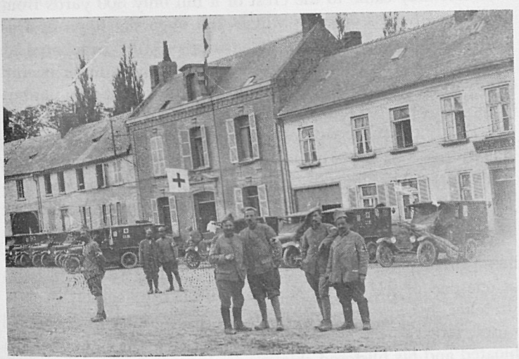
BOVES AND THE DIVISION DRESSING STATION

It was late in the afternoon as the section drove into the little, evacuated town of Boves. The sun shone hazily and the men's spirits perked up in spite of the anxiety the new adventure brought. All civilians had been evacuated and an undamaged house became the unit's quarters. A field kitchen was set up and here the men were quartered when not on