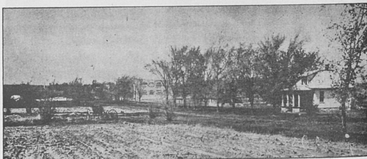
After the Town Failed

After 1915, residents of the town changed its name from Lithograph City to Devonia and struggled to keep it going, but they failed after a short two year existence. Their efforts to obtain a post office there failed also. The town died completely, and, the Des Moines Register and Leader reported that by 1938 it was completely plowed under. Since it had no post office, it is rarely listed with ghost towns or abandoned Iowa towns and is rarely found on maps.