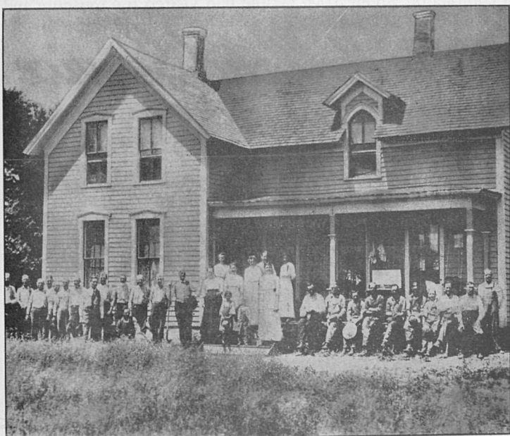
Litho Hotel and People Who Built Town

stone polishing plant, lumber yard, general store, and several foundations.