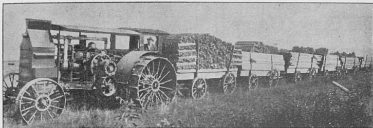
Like Tractor-Train Used by Webster

stone polishing plant, lumber yard, general store, and several foundations.