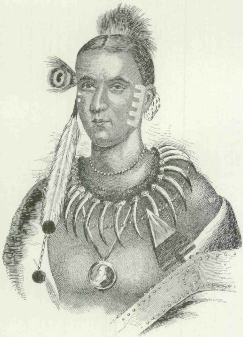
MA-HAS-KA, OR WHITE CLOUD, An Iowa chief, for whom one of our large and populous counties was named.