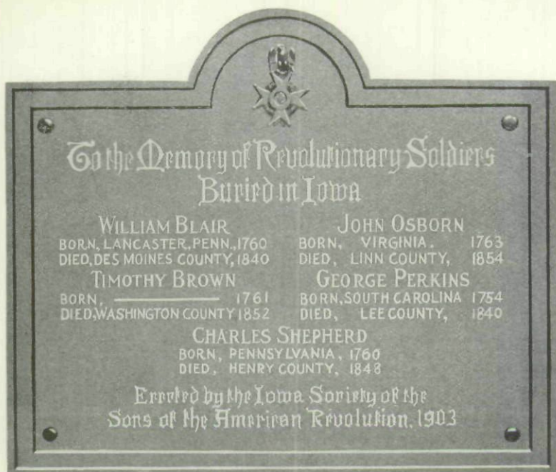
This engraving gives an excellent representation of the Bronze Tablet unveiled in the Art Gallery of the State Historical Department, by the Iowa Sons of the American Revolution, April 19, 1904, to the memory of five Revolutionary soldiers who died and were buried in this State.