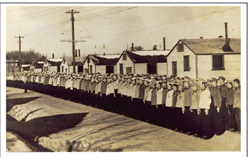
Prisoners line up in front of their barracks.

denly, a war occurring thousands of miles across the world was coming directly into the heartland.