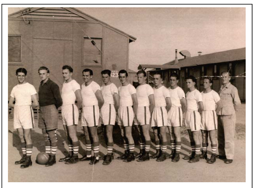
Recreational activities, especially sports, were an important means of combating boredom in the POW camps, thus contributing to a safe and secure environment.

were paid 80 cents per day for work outside of the camp; those who worked within the camp made 10 cents per day. Prisoners had the choice of placing the money earned in a trust fund account to be redeemed upon repatriation or receiving wages in the form of canteen coupons redeemable at the PX. One Camp Algona officer stated, "They aren't interested in saving the money they earn. It doesn't mean anything to them as prisoners. They like real things that they can see and feel and use."<sup>24</sup>