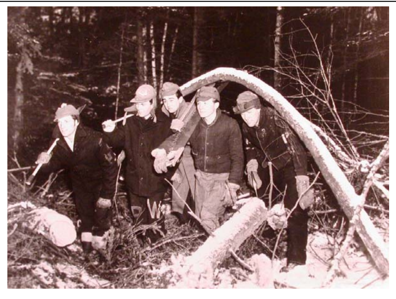
POWs at branch camps worked at a variety of tasks, including logging and brush clearing.

with his sugar beet crop. In September 1945 the Fort Dodge Messenger reported that German POWs from Camp Algona were engaged in clearing trees and brush from roadsides where roadwork was being conducted.<sup>38</sup> The more efficient procurement process also encouraged the establishment of additional branch camps throughout Iowa in 1945 to alleviate labor shortages.<sup>39</sup>