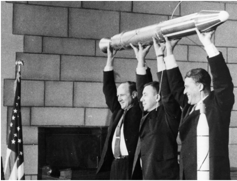
The three men most responsible for the success of Explorer 1, America's first Earth satellite, launched January 31, 1958: Dr. William H. Pickering (left), former director of the Jet Propulsion Laboratory, which built and operated the satellite; Dr. James A. Van Allen (center) of the State University of Iowa, who designed and built the instrument on Explorer that discovered the radiation belts that circle the Earth; and Dr. Wernher von Braun (right), leader of the army's Redstone Arsenal team that built the modified Redstone rocket that launched Explorer 1.

Explorer 1's launch date was a very happy day for Van Allen — so happy in fact that in a photograph he and his colleagues are shown with the satellite hoisted above their heads in a triumphant stance. He later recalled,