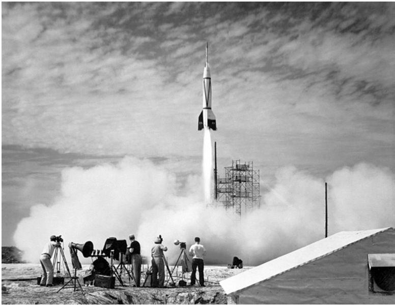
The Bumper V-2 was the first missile launched at Cape Canaveral on July 24, 1950.