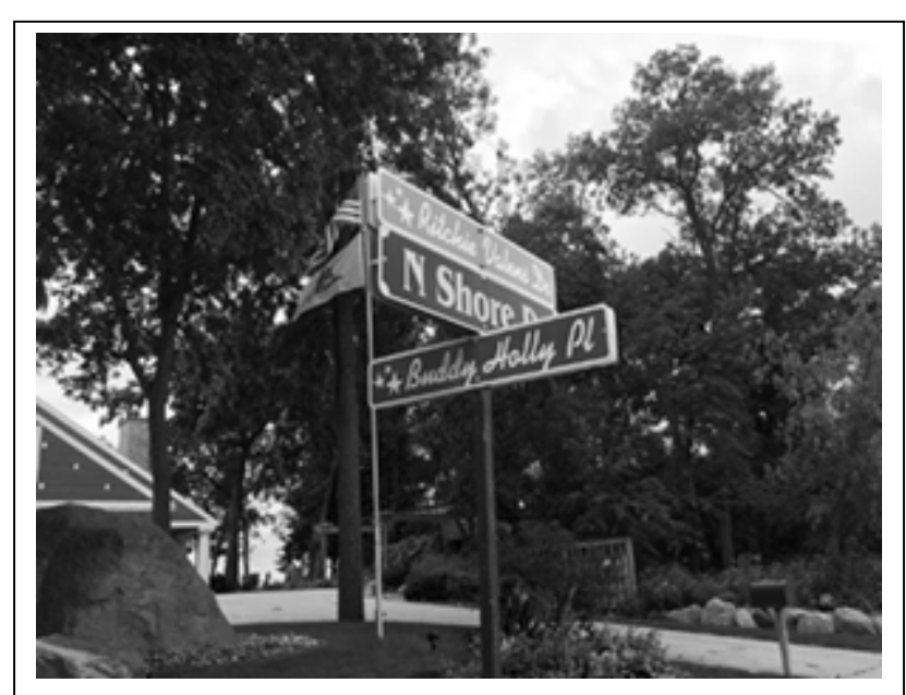
In 1988 a section of street in front of the Surf was renamed Buddy Holly Place. In 2009 one segment of North Shore Drive was renamed Ritchie Valens Drive. Author's photograph.

lane and waxing nostalgic about the "ghosts of the past" that haunt the ballroom. "On the sweeping maple dance floor of the Surf Ballroom, love and memory mix magically, then linger like the swirling, cloudlike light patterns on the ceiling. . . . From Basie to the Beach Boys, America's music has waltzed, jitterbugged, twisted, and boogied through the Surf Ballroom. In more subdued fashion, it still does." 58