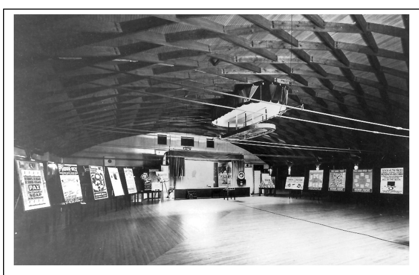
This photograph of the Surf's ballroom from the 1930s shows off both the venue's Lamalla roof, a vaulted style that was very popular in the late 1920s and early 1930s, and its dance floor made entirely from maple, an attribute that Carl Fox promoted to prospective dancers at the Surf.

its architecture, interior design, and up-to-date amenities reflected this nationwide desire for the new and novel, despite the deprivations of the Great Depression.<sup>10</sup>