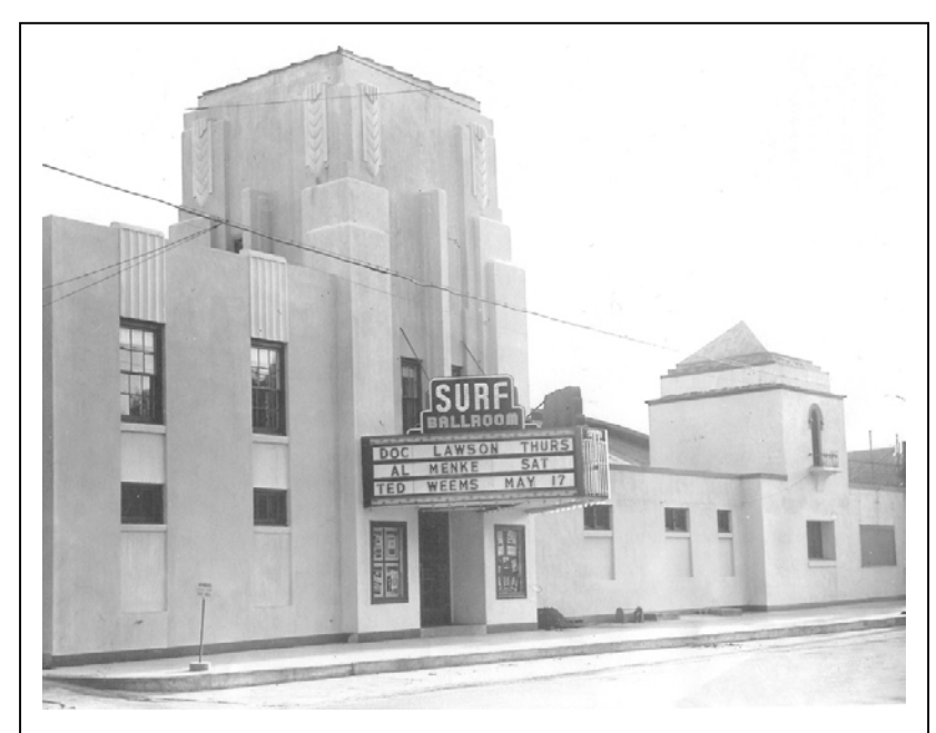
The Surf Ballroom's Art Deco style architecture reflected the trend toward the new and modern in contrast to the Victorian-style dance halls of the early twentieth century.

8,000 square feet, accommodating 500 couples easily," and was made entirely of maple, "laid in such a way that the dancers will always be going with the grain of the wood." The Surf also featured state-of-the-art ventilation and heating innovations for its time. It opened in April 1933 with Wally Erickson's Marigold Orchestra of Minneapolis entertaining the opening night crowd.9