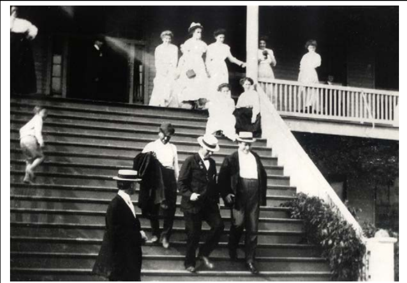
Orator and politician William Jennings Bryan (and associates) visited Clear Lake in 1908 for the Chautauqua.

A wide range of well-known figures, including temperance firebrand Carrie Nation and orators such as Booker T. Washington and William Jennings Bryan, made their way to Clear Lake for the summer chautauquas. The Clear Lake Chautauqua only lasted until 1914, its demise hastened by many other competing summer attractions in and around the area. But it helped create the tourist trade, contributing to the community's thriving reputation as a summer vacation spot. 5