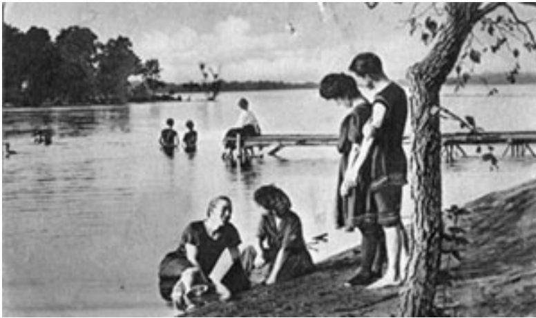
A 1908 postcard captioned "Bathing Scene – Oakwood Park, Clear Lake" captures Clear Lake's already established reputation as a destination for recreation, relaxation, and natural beauty.