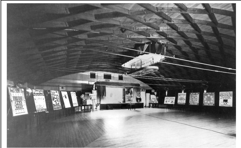
This photograph of the Surf's ballroom from the 1930s shows off both the venue's Lamella roof, a vaulted style that was very popular in the late 1920s and early 1930s, and its dance floor made entirely from maple, an attribute that Carl Fox promoted to prospective dancers at the Surf.

its architecture, interior design, and up-to-date amenities reflected this nationwide desire for the new and novel, despite the deprivations of the Great Depression. 10