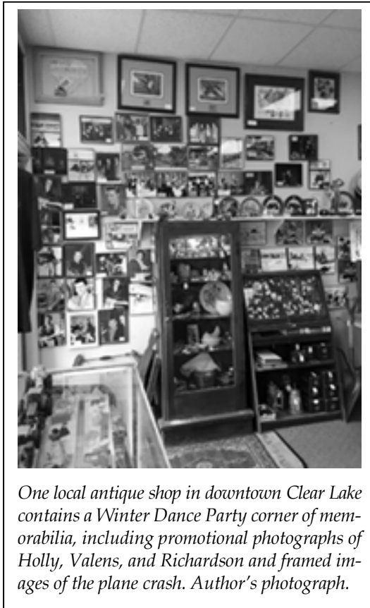
One local antique shop in downtown Clear Lake contains a Winter Dance Party corner of memorabilia, including promotional photographs of Holly, Valens, and Richardson and framed images of the plane crash.

In the immediate aftermath, Clear Lake, and northern Iowa more broadly, moved on relatively quickly. On February 4, the Globe-Gazette noted that these “Dead Rock ‘n’ Roll Stars Had Many Fans” in Mason City, and the reporter interviewed several record-store owners in town to verify that claim. 51 Most press coverage at the time noted that the entertainers were young and that they were “all on the way up as singers.” Holly had the most established career, having toured in England for 25 days in 1958. Several years later, the Beatles discussed Holly’s influence on their band’s style and musical sound.