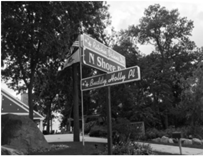
In 1988 a section of street in front of the Surf was renamed Buddy Holly Place. In 2009 one segment of North Shore Drive was renamed Ritchie Valens Drive.

lane and waxing nostalgic about the “ghosts of the past” that haunt the ballroom. “On the sweeping maple dance floor of the Surf Ballroom, love and memory mix magically, then linger like the swirling, cloudlike light patterns on the ceiling. . . . From Basie to the Beach Boys, America’s music has waltzed, jitterbugged, twisted, and boogied through the Surf Ballroom. In more subdued fashion, it still does.” 58