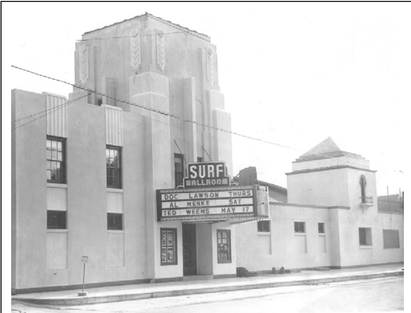
The Surf Ballroom's Art Deco style architecture reflected the trend toward the new and modern in contrast to the Victorian-style dance halls of the early twentieth century.

8,000 square feet, accommodating 500 couples easily," and was made entirely of maple, "laid in such a way that the dancers will always be going with the grain of the wood." The Surf also featured state-of-the-art ventilation and heating innovations for its time. It opened in April 1933 with Wally Erickson's Marigold Orchestra of Minneapolis entertaining the opening night crowd. 9