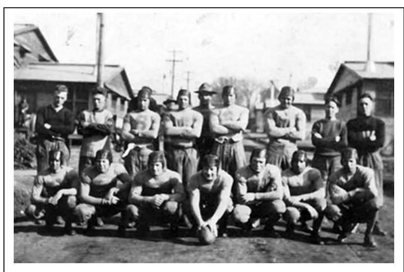
Members of the football team from Supply Company, 350th Infantry Regiment, 88th Division posed for this image in November 1917.

five of seven events and tying with the Funston athletes in two others." 40