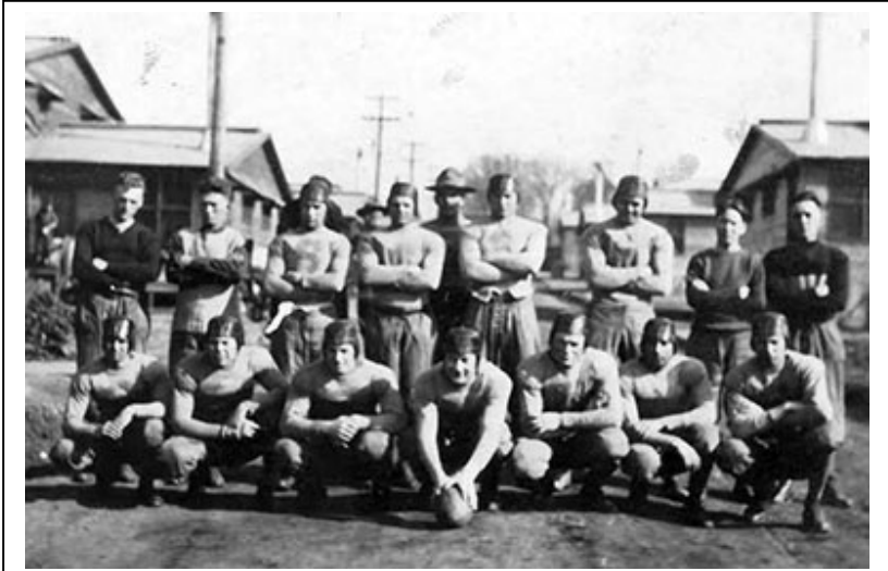
Members of the football team from Supply Company, 350th Infantry Regiment, 88th Division posed for this image in November 1917.

five of seven events and tying with the Funston athletes in two others.” 40