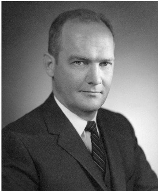
Norman Erbe (1919–2000), Iowa governor, 1961–1963.

Erbe's strategy during his re-election bid in 1962 was to avoid making waves. The Iowa legislature, not the governor, he argued, makes the laws. "I don't want to come out whole hog for this position or that if it doesn't materialize in the Legislature," he said. "There's no use doing this unless you know you have the votes. . . . My concept of the governorship is that of an administrator and executive through persuasion. In our weak governor system, it's impossible for the governor to impress his will if the Legislature or government departments don't want to follow." Erbe said that the liquor-by-the-drink issue was up to the Iowa General Assembly; he wasn't going to push the issue. He claimed to be guided by the state Republican platform, which only said that the issue should be "studied." He refused to go further than that. 24