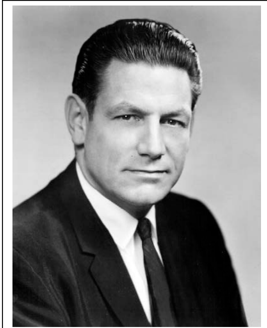
Harold Hughes (1922–1996), Iowa governor, 1963–1969.

to give up alcohol, sought help, and became intensely involved in the Methodist church, even volunteering as a Sunday school teacher. Hughes was open about his alcoholic past, discussing it freely when asked about it on the campaign trail. He was careful to say that he was a recovering alcoholic, not a cured one. 21