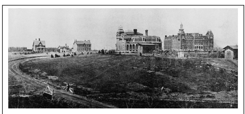
View of the IAC campus, circa 1870.