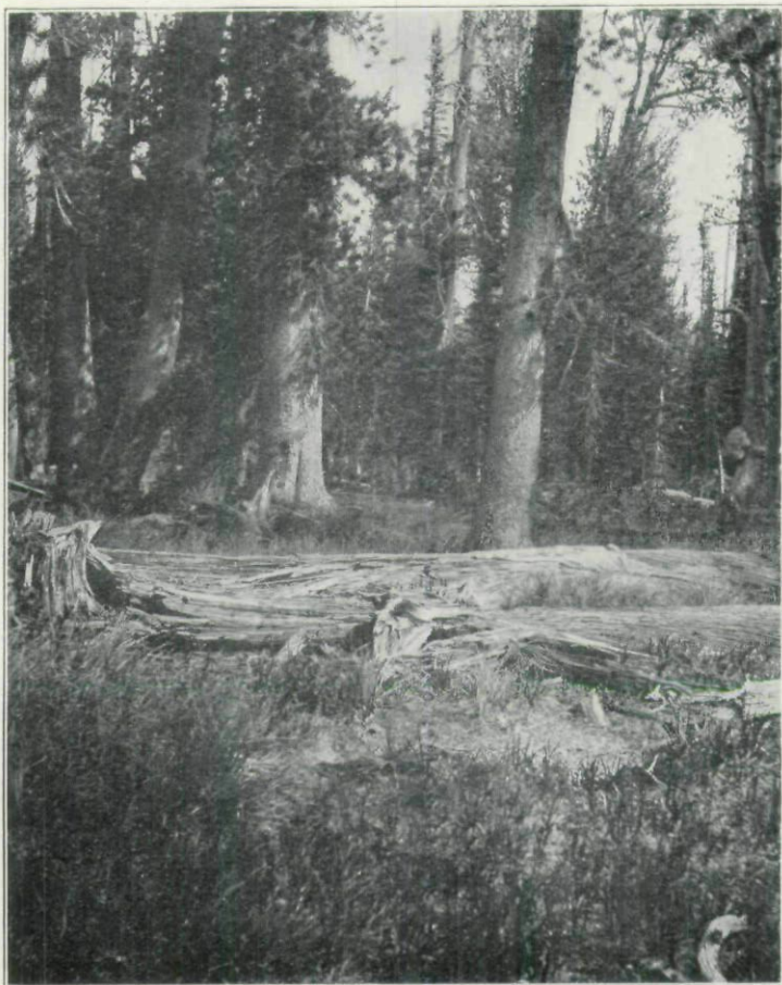
Rocky Mountain White Pine ( Pinus flexilis James)