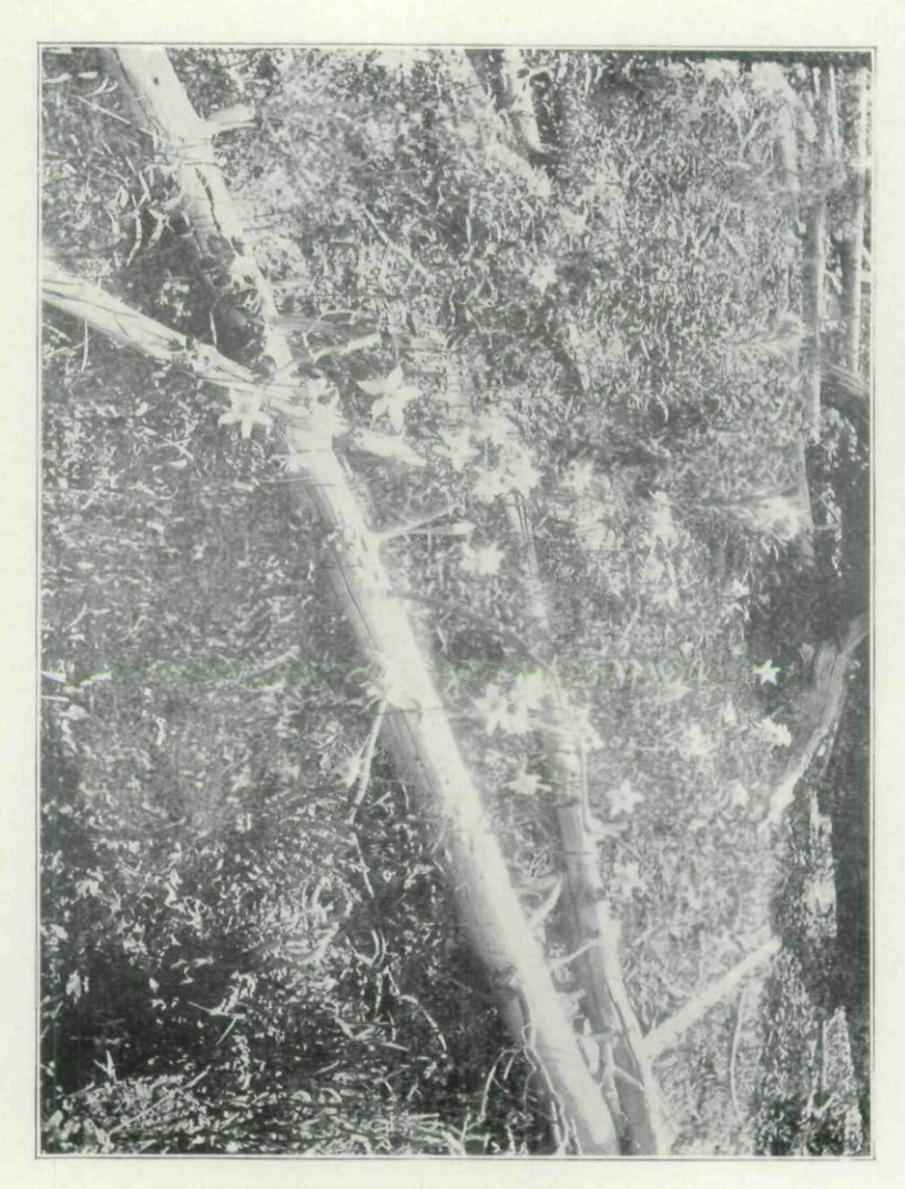
The Rocky Mountain Columbina (Aquilegia caerulea James)