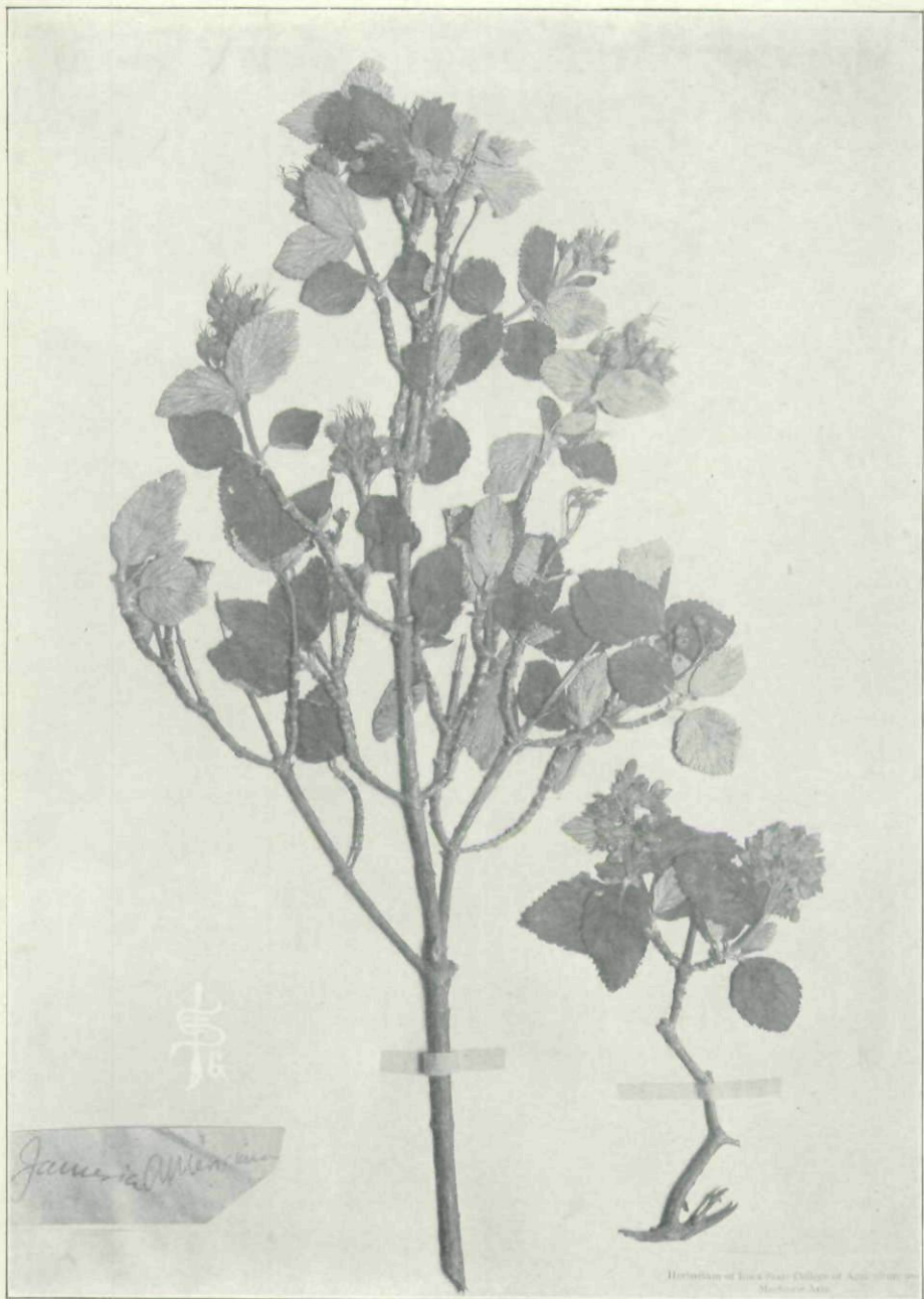
Jamesia Americana named by Drs. Torrey and Gray, the genus. Commemorating Dr. Edwin James