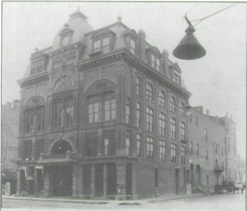
Peavey Grand Opera House, c. 1890.

WHEN ALPHEUS BEALL ARRIVED in Sioux City in 1888 at the age of 22, he encountered a city embarked on a period of sustained prosperity. By 1889 three Sioux City meatpackers were doing a combined business of $7.6 million. By 1890 the population had reached thirty-seven thousand, a remarkable increase of thirty thousand in ten years. And "its economy constituted the heaviest industrial concentration in the state of Iowa." This commercial boom created many new jobs, including clerical positions. Also, during this time period, Sioux City men in their twenties were particularly successful in improving their economic situation. This group, as well as men in their thirties, experienced frequent and rapid advancement. 34 In keeping with this pattern, Beall began as a bank clerk and worked in the banking business for seven years. He advanced rapidly, and at the relatively young age of 29, in 1895, he became secretary of the Iowa Investment and Trust Company.