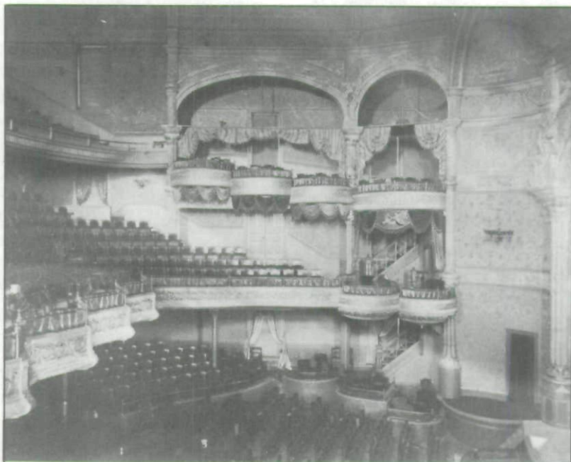
Peavey Grand Opera House interior. Photo taken on opening night, September 24, 1888.

gold silk curtains, velvet English carpets, white French tapestry and lace curtains, Venetian silk velour in orange and blue, and other evidently opulent furnishings, selected by Booge. The theater itself was 120 by 70 feet. The stage was 70 feet wide, 42 feet deep, and 60 feet high. The auditorium was divided into ground floor, balcony, and gallery, with special boxes available. The entire structure, located on Fourth and Jones streets, was 200 feet long, 70 feet wide, and 146 feet from the top of the building to the street. 32 By any standard, it represented a sumptuous "Temple of the Muses." As a production facility it presented all the greats and near greats of American and western theater. Edwin Booth, James O'Neill, the Divine Sarah Bernhardt, Joseph Jefferson III, Eleanora Duse, Helena Modjeska, Julia Marlowe, and Otis Skinner were but a few of the many that graced her boards in the early days. Charity