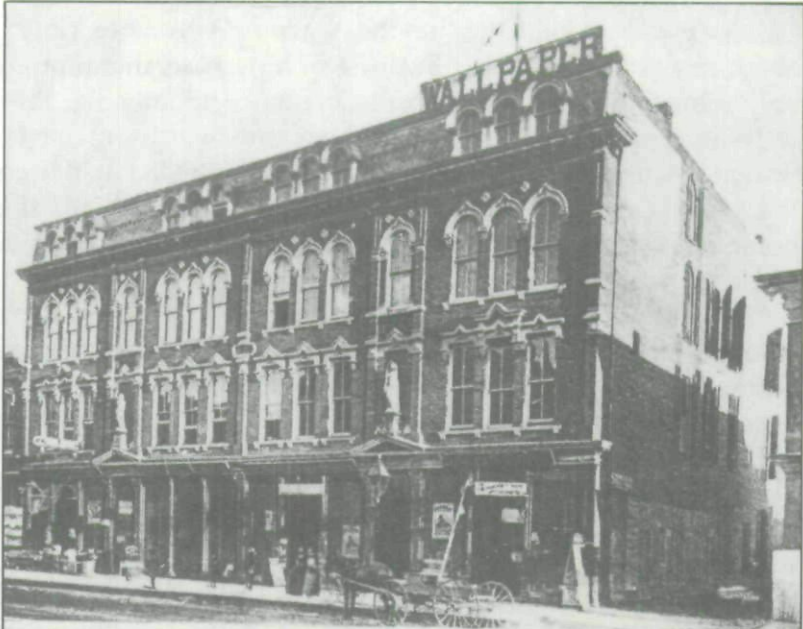
The Academy of Music, 1888.

cated that more than money influenced the Academy's development; civic responsibility and pride took precedence over profit and individual gain.