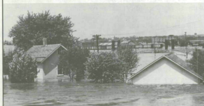
This series of three photographs illustrates the character of Bottoms residences in the 1930s and the extent of flooding in 1934.