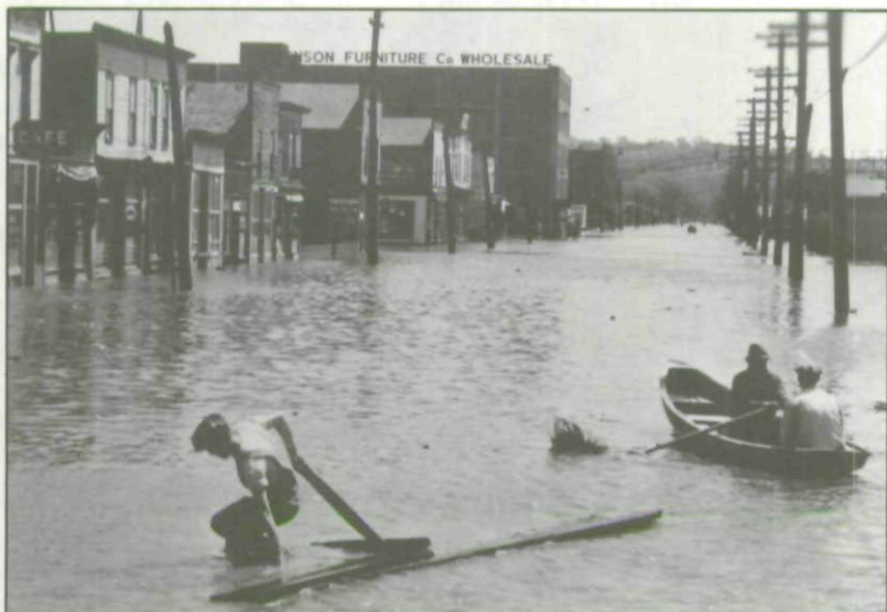
The original location of the Community House on the second floor of the Edwards and Browne Coal Company at 1604 Fourth Street is just out of the picture in the right foreground of this photograph of the 1934 flood.

building. The committee had $750 when they began planning, but lost that money in a bank failure. 54