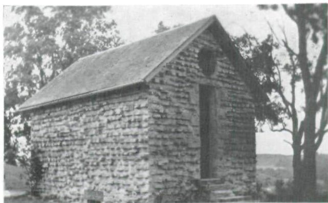
Front View of Ice House Containing The Sickle & Sheaf