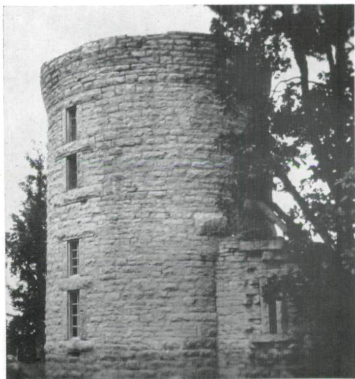
"Old Water Tower," Stone City