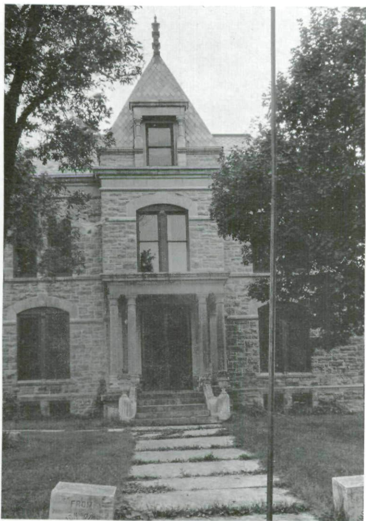
John A. Green Mansion, Built 1883

The basket of fruit and basket of flowers, on small pillars in front of the mansion, were carved from huge blocks of stone from the Champion quarries. They were a part of the Stone City exhibit at the Columbia Exposition.