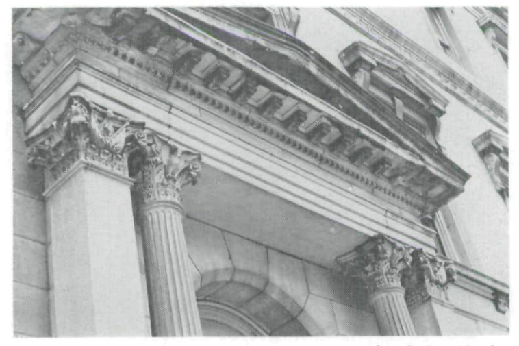
Detail Over West Door