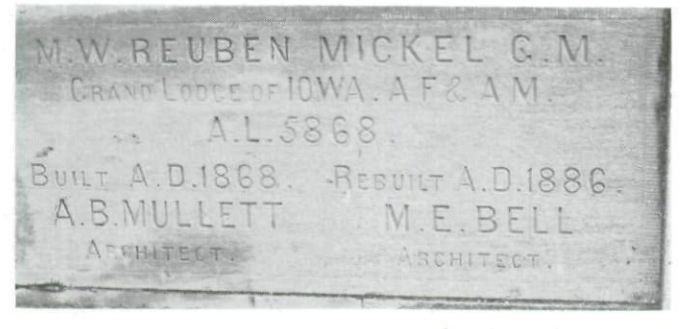
Cornerstone of Old Federal Building