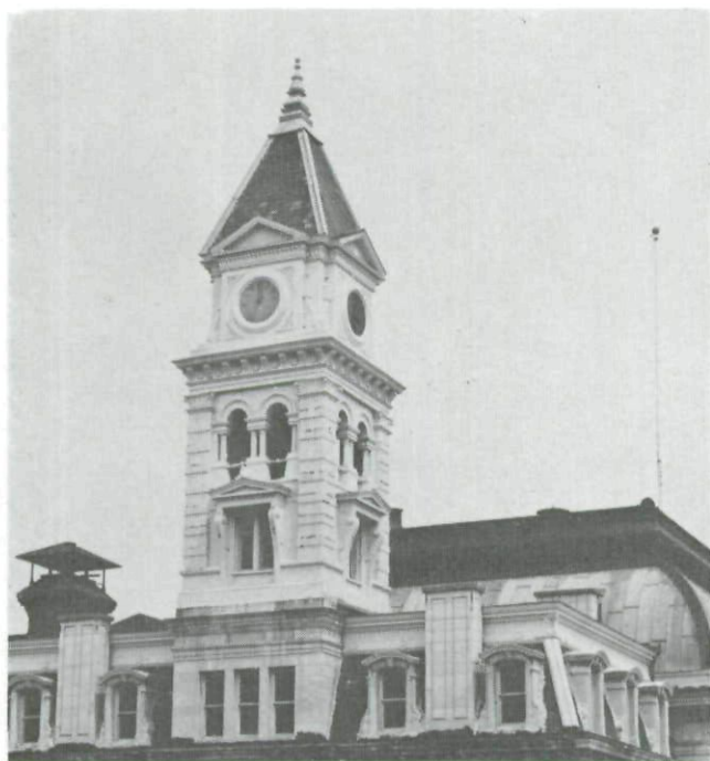
Clock Tower