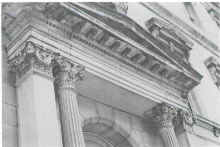
Detail Over West Door