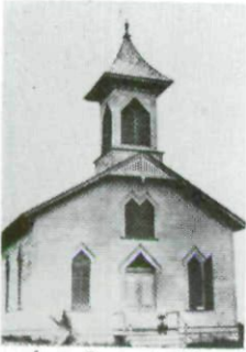
from Souvenir History of Colesburg Congregational Church, 1907

that reached the greatest number of people was a union meeting of three weeks held by "Billy" Sunday in 1899.