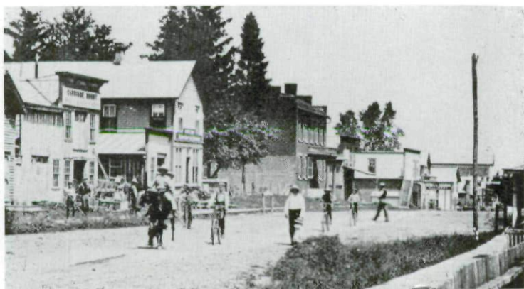
from Souvenir History of Colesburg

towns, Colony and "Coles Burgh" were practically one, the Main Street running through the center of each. Since they were so close together, they later came to be known as one, called Colesburg.