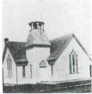
from Souvenir History of Colesburg Methodist Church, 1900