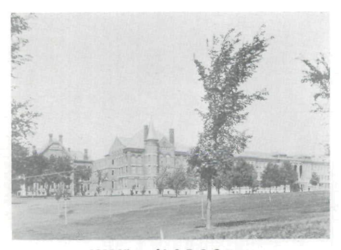
1915 View of I. S. T. C. Campus

When I was growing up, the Iowa State Normal School was not even a name to me. Probably most of my neighbors were only dimly aware that there was, 150 miles to the north of us, a thriving educational mill, busily turning out teachers for the elementary schools of the state. However, a few ambitious young women of our community, teachers in the rural schools of which they were a product, had heard of it and had begun to set their sights on Cedar Falls—they tended to use the name of the town rather than of the school itself. And in due course, they did take their hoarded savings and board the train for Cedar Falls, where, if they could stretch their funds, they could get a few terms of training which led to better certification and better positions, perhaps even in town schools. They came back home singing: