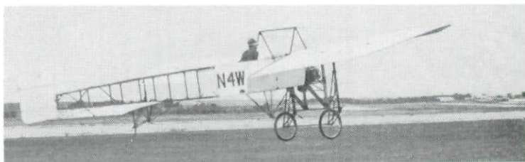
The Bleriot XI

The Bleriot XI is believed to have been the once wrecked, stored, plane used by John B. Moisant flying circus—the group that performed the first airplane flying exhibition in Iowa at the Hyperion Club in Des Moines in 1911. This original model of one of the first successful monoplanes is now suspended in the rotunda of the Historical Building.