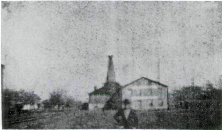
1890 PHOTO OF GLASS FACTORY TAKEN WITH PINHOLE CAMERA.

At the base of the furnace was an ash pit which arched up to the furnace grates. Thus the general setup of the furnace, beginning at ground level, was this: ash pit, grate, fire pot; then at about the level of the second floor, a floor-like extension over the fire pot with a fairly small hole leading up into the chimney, and with pots for glass making resting on this floor.