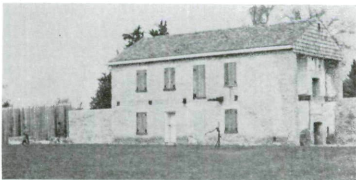
RESTORED BARRACKS AND STOCKADE WALL

in 1959 by the Conservation Commission. This beautiful historic site, where fifteen hundred Winnebagoes once held a pow-wow with Governor Dodge and smoked the peace pipe, 120 years ago, was dedicated to the people of Iowa in 1962.)