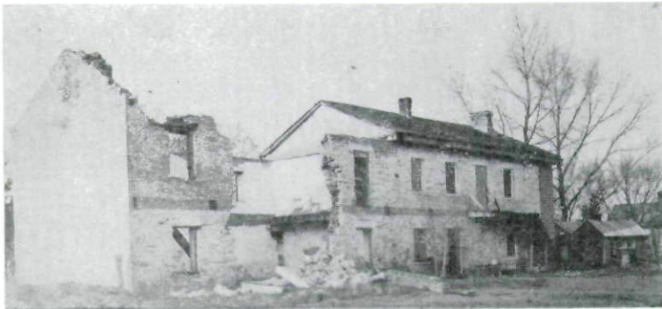
BARRACK RUINS AT FORT ATKINSON

Once the troops left, the fort rapidly fell into disrepair, Set-