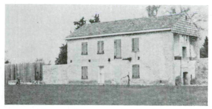
RESTORED BARRACKS AND STOCKADE WALL

in 1959 by the Conservation Commission. This beautiful historic site, where fifteen hundred Winnebagoes once held a pow-wow with Governor Dodge and smoked the peace pipe, 120 years ago, was dedicated to the people of Iowa in 1962.)