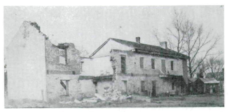
BARRACK RUINS AT FORT ATKINSON

Once the troops left, the fort rapidly fell into disrepair, Set-