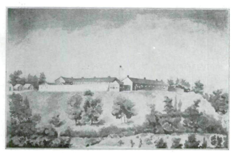
FORT ATKINSON, WINNESHIEK COUNTY, IOWA, AS IT APPEARED IN 1842. CUT WAS REPRODUCED FROM AN ORIGINAL DRAWING ON FILE IN WASHINGTON, D.C.

In 1846 the government negotiators persuaded the Winnebagoes to accept land north of the Minnesota River. In this new home they found themselves in the unenviable position of again serving as a buffer, this time between warring bands of Sioux and Chippewa. Thus the luckless Winnebagoes were no better off than they had been while living on the Neutral Ground in Iowa. In fact, they were even worse off than before. At their new home the growing season was shorter, and the soil poorer, and soon hundreds of Winnebagoes returned to Iowa and Wisconsin. In 1848-49 the troops from Fort Atkinson again escorted the Winnebagoes from the Neutral Ground-this time north to a location near the Crow Wing reservation in Minnesota. This was an area with good soil, away from the war-like Sioux, and away from white settlers, at least for the time being. With the Winnebagoes gone, the Sac-Fox tribe pushed farther west and south, and the Sioux soon to be removed from the area, there was little need for the mounted troopers at Fort Atkinson. When the dragoons finished moving the Winnebagoes into Minnesota, they returned to the fort, gathered their equipment and per-