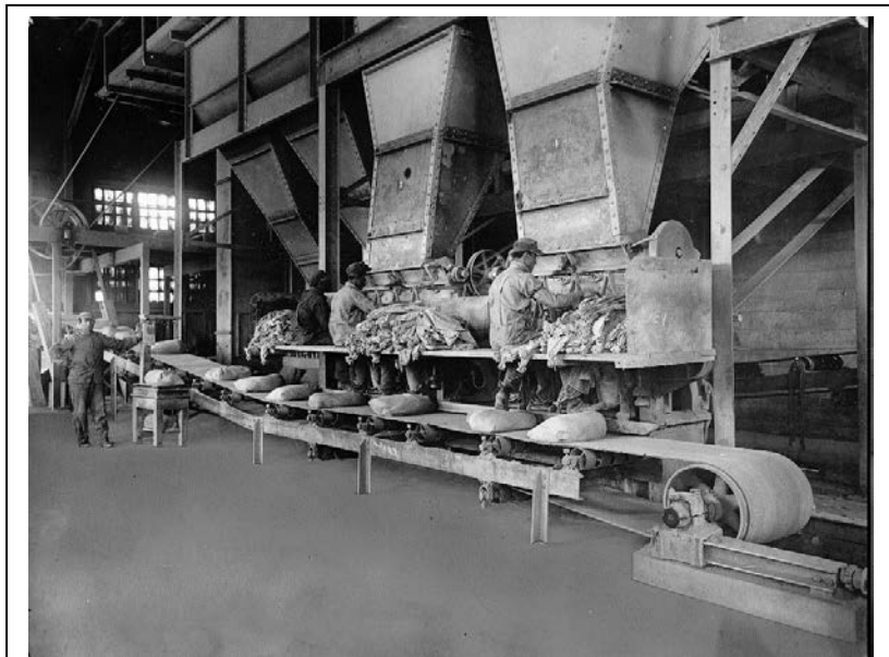
A diverse immigrant workforce worked at sacking machines at the Portland Cement Company in Mason City.