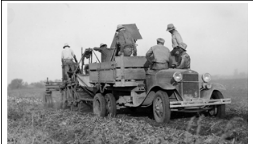
A group of farm workers and farmers ride on a truck near Mason City, ca. 1910–1920.

whites” who were not welcomed as permanent community members. Agricultural employers also sought Mexicans because of their lack of political strength in the Midwest, which made them more susceptible to labor controls and exploitation.